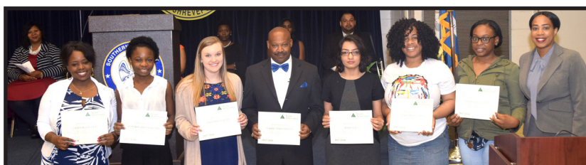
Junior Achievement Volunteers