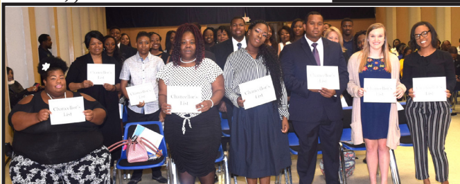
Chancellor's List (4.0)