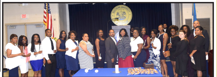
Phi Theta Kappa Inductees