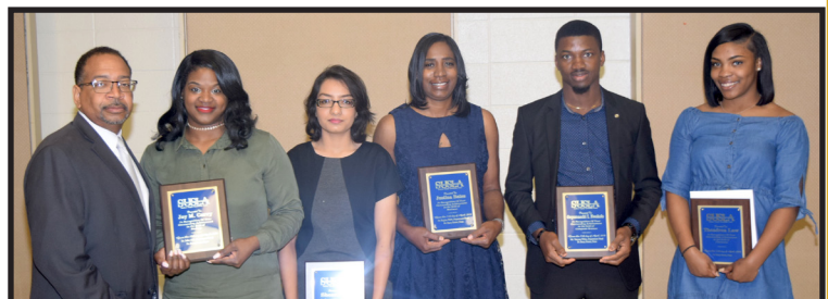
STEM Award Recipients