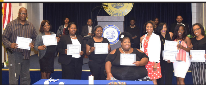
Human Services Internship Awards