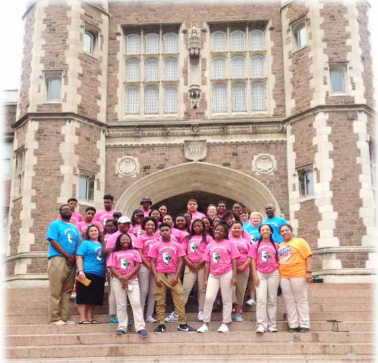
TRiO Upward Bound Natchitoches at Washington University of St. Louis